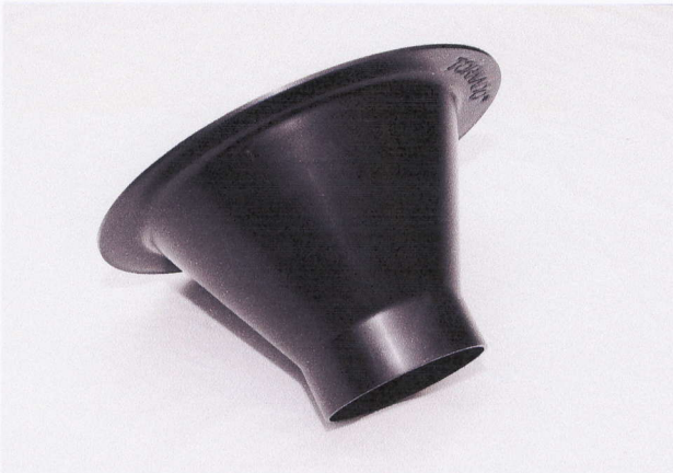
TORNADO Micro, 100 and 150. Suitable for installation in any box guttering system installations.

MANUFACTURED IN AUSTRALIA FROM U/V TREATED 4MM POLYPROPYLENE - VIRTUALLY INDESTRUCTABLE